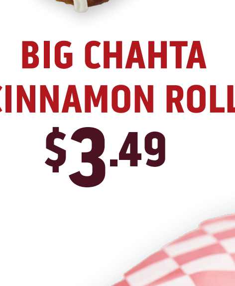
BIG CHAHTA CINNAMON ROLL $3.49