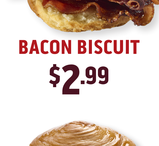
BACON BISCUIT $2.99