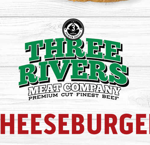
THREE RIVERS CHEESEBURGER $5.99