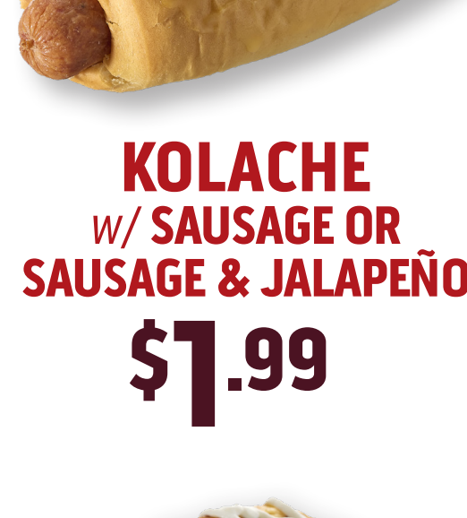
KOLACHE w/ SAUSAGE OR SAUSAGE & JALAPEÑO $1.99