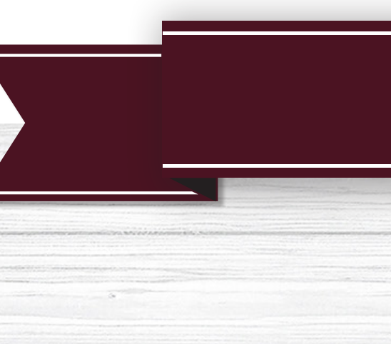
JUMBO CORN DOG