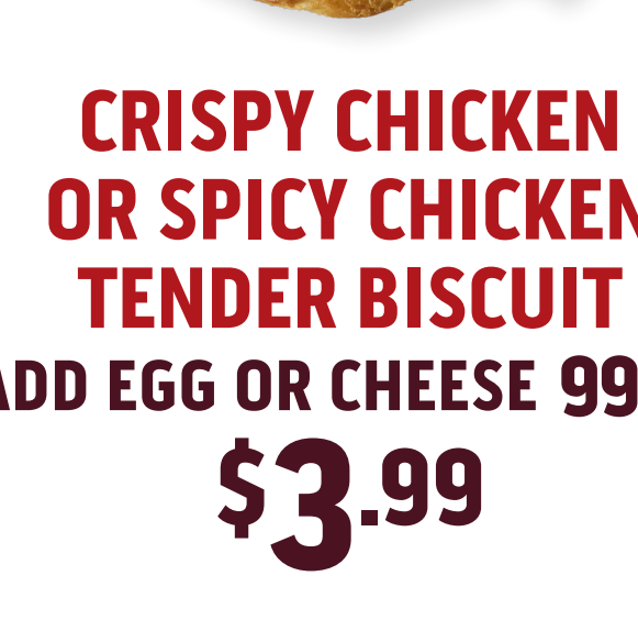
CRISPY CHICKEN OR SPICY CHICKEN TENDER BISCUIT ADD EGG OR CHEESE 99¢ EA. $3.99