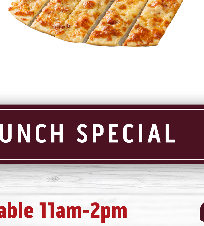
CHEESE BREAD $6.99