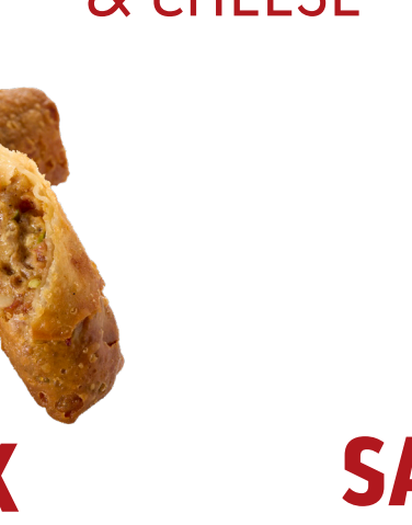
BURRITO BEEF, BEAN & CHEESE