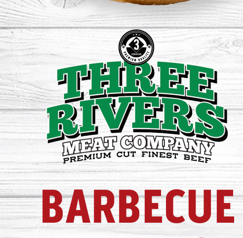
THREE RIVERS BARBECUE PULLED PORK SANDWICH $5.99