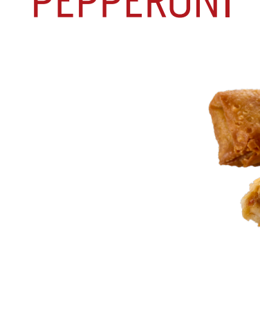
PIZZA POKET PEPPERONI