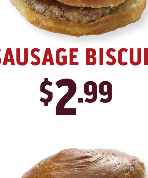
SAUSAGE BISCUIT $2.99