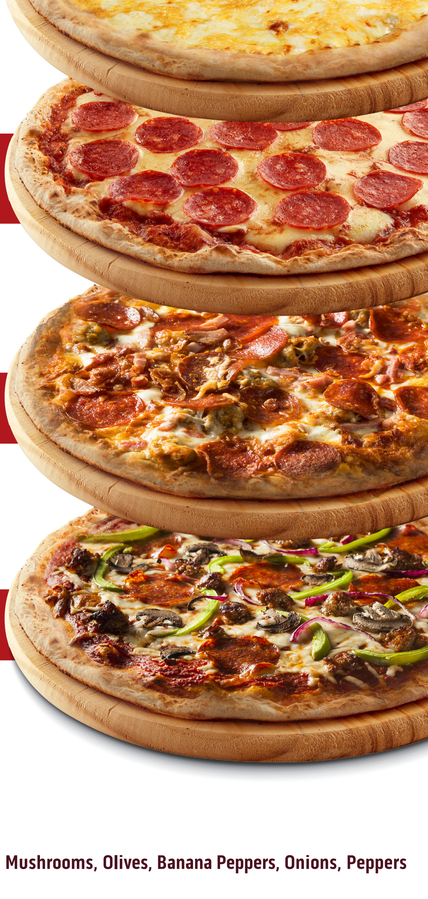
$16.99 16" Whole Pizza

+ Extra toppings $0.99 each Extra Cheese, Pepperoni, Sausage, Bacon, Mushrooms, Olives, Banana Peppers, Onions, Peppers