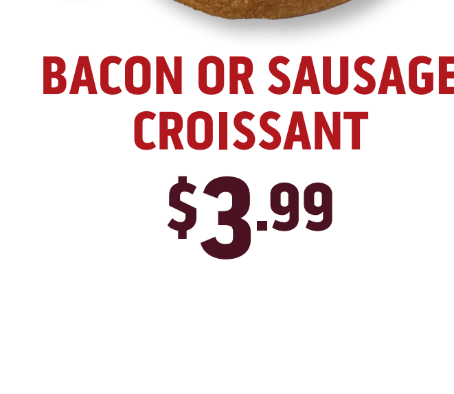
BACON OR SAUSAGE CROISSANT $3.99