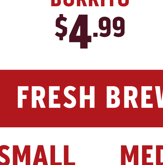
BREAKFAST BURRITO $4.99