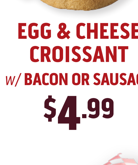
EGG & CHEESE CROISSANT w/ BACON OR SAUSAGE $4.99