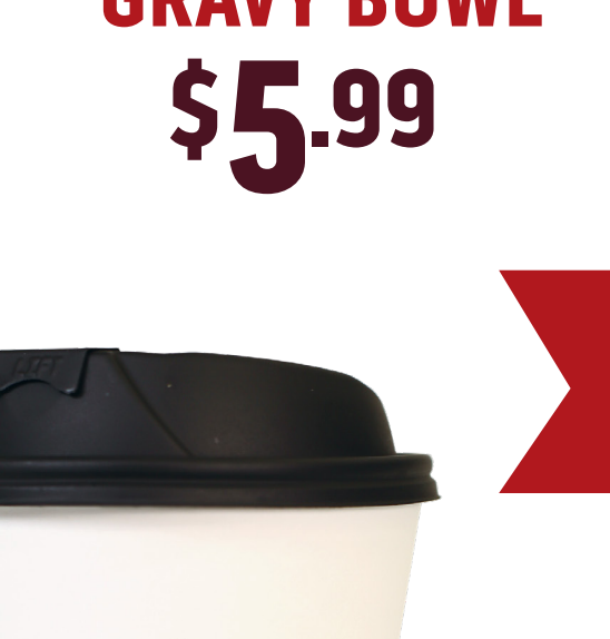
BISCUIT & GRAVY BOWL $5.99