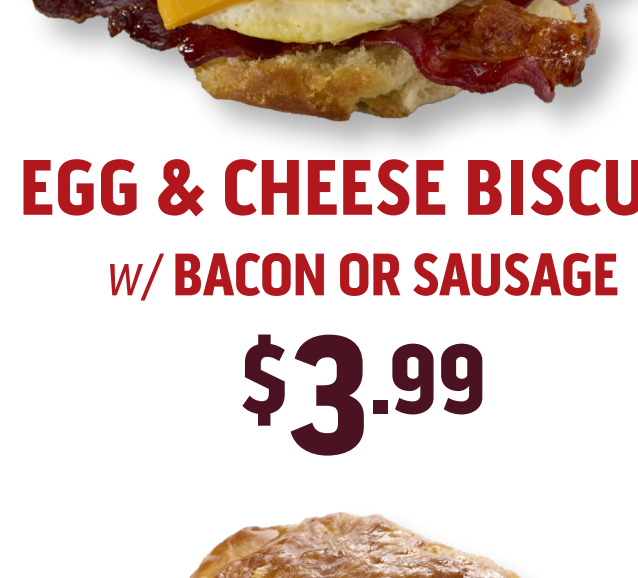
EGG & CHEESE BISCUIT w/ BACON OR SAUSAGE $3.99