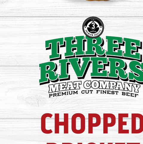
THREE RIVERS CHOPPED BRISKET SANDWICH $6.99