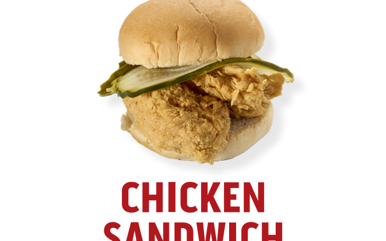
SIGNATURE CHICKEN TENDER INDIAN FRY BREAD $6.99