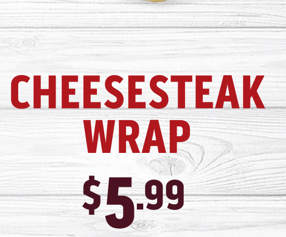
CHEESESTEAK WRAP $5.99