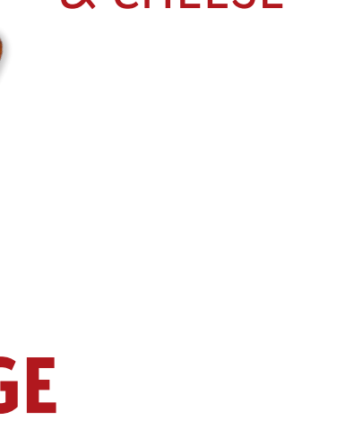
CRISPITO CHICKEN & CHEESE